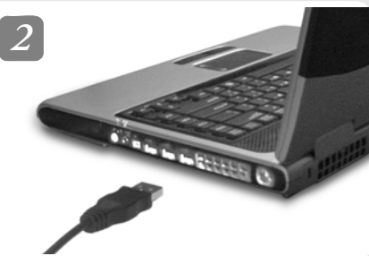
Connect the USB cable to the computer