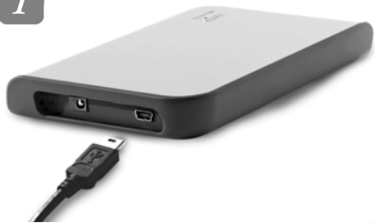
Connect the USB cable to the drive