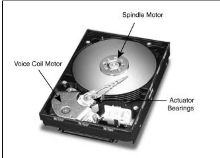
Figure 1. Three Hard Drive Mechanical Components

Running the drive for extended periods of time at too high a temperature can damage it and lead to permanent data loss. A thermal sensor can detect the environmental conditions that affect drive reliability, including ambient temperature, rate of cooling airflow, voltage, vibration, and duty cycle.